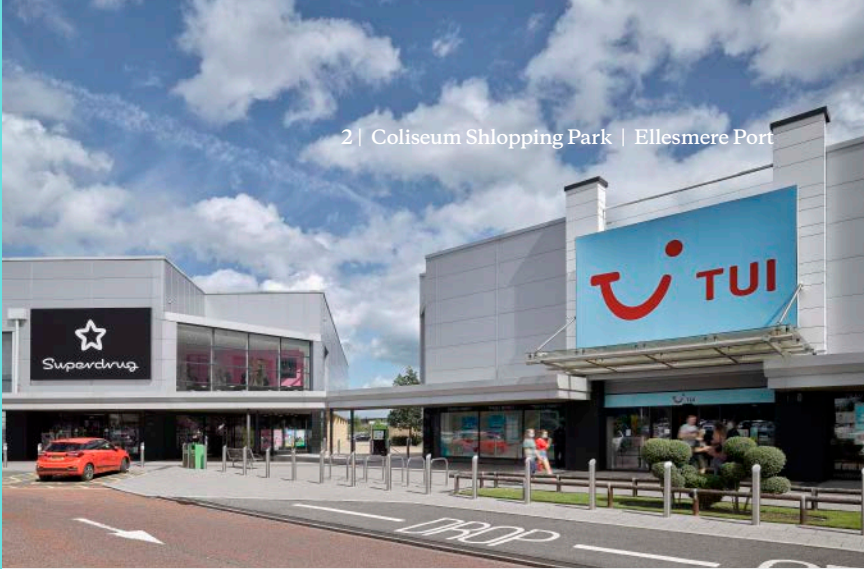
2 | Coliseum Shlopping Park | Ellesmere Port