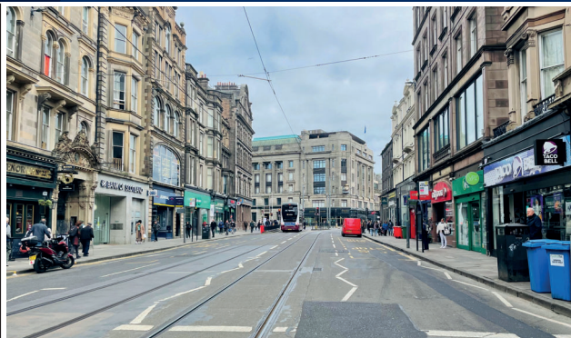
View along Shandwick Place to the Johnnie Walker Whisky Experience