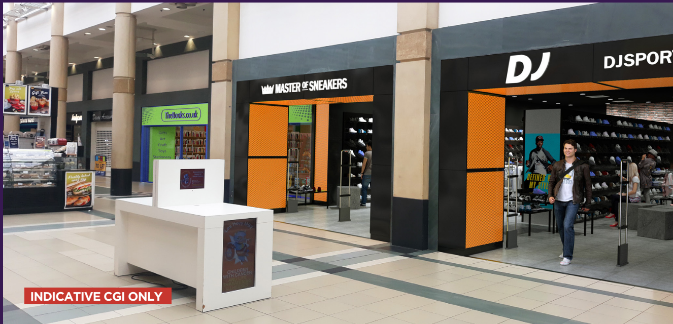
INDICATIVE CGI ONLY